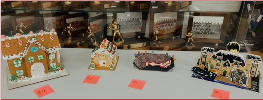
Gingerbread contest finalists.

It is important that we know and understand the reality of depression and know what to do in real life situations. Know the signs and symptoms and don't hesitate to seek help. If you or a loved one is struggling with depression, you can call the 988 Suicide and Crisis Lifeline or chat at 988lifeline.org.